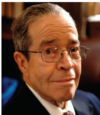
Jesse Ernest Wilkins, Jr. 1923-2011 MATHEMATICIAN

Major developments: mathematical models to explain gamma radiation